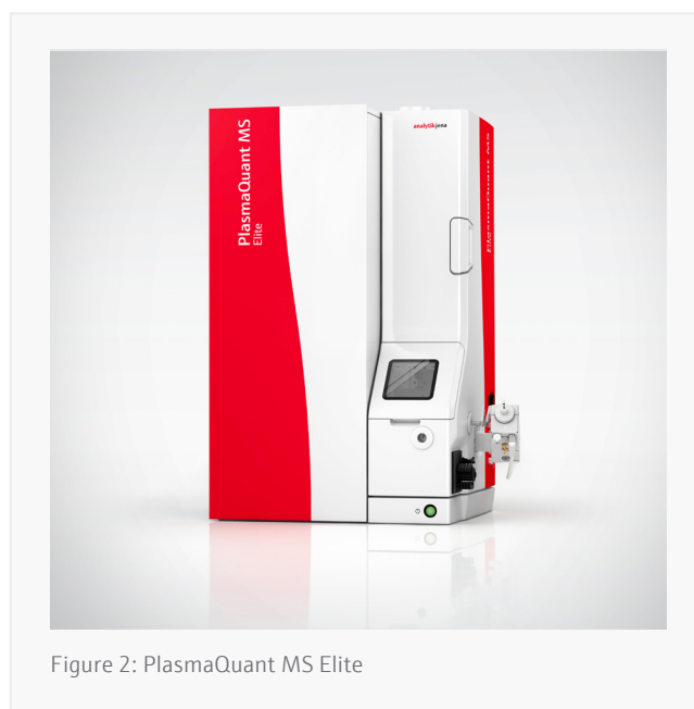
Figure 2: PlasmaQuant MS Elite

The PlasmaQuant MS Elite was successful in determining the concentrations of REE in different geological certified reference materials after performing a sintering digestion with \text{Na}_2\text{O}_2 . From the Z-score analysis, it can be concluded the iCRC interference management system effectively removes polyatomic interferences and allows for the accurate and precise measurement of REEs without pre-defined correction equations. At the same time, the high sensitivity allows very low method detection limits in the ng/kg to \mu\text{g/kg} range to be routinely achieved.