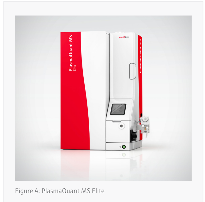
Figure 4: PlasmaQuant MS Elite

The experiments show the need for reference materials that are characterized for more elements and contain different concentration ranges. This would lead to further improvements in data quality and validation of the method.