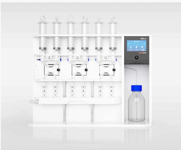
Figure 1: APU sim

The example curves of the industrial wastewater sample are showing the influence of the complex matrix of this sample: column 2 contains nearly 50% of the content of column 1, so a „breakthrough“ can be assumed. A second analysis with the same sample but in a higher dilution ratio helps to verify whether the adsorption process was complete or if an AOX “breakthrough” has occurred. The result of the 1 in 50 diluted sample (1330 µg/L AOX), where only approx. 20% of column 1’s content can be found on column 2, is nearly the same as for the less diluted sample (1297 µg/L AOX). This finally confirms that no AOX “breakthrough” took place during the sample adsorption step. Experienced users can easily judge the quality of AOX results by evaluating the curves of the two columns. Often there is no need for a repeated analysis of the same sample in a higher dilution ratio. When applying the batch method to such a sample, no statements can be made about the completeness of the adsorption step, since only one aliquot of activated carbon is used for AOX adsorption and measurement by the batch method. Therefore, it is a must to run replicates with different dilution ratios to avoid falsified results.