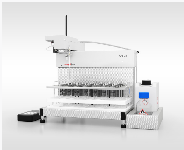
Figure 2: APU 28