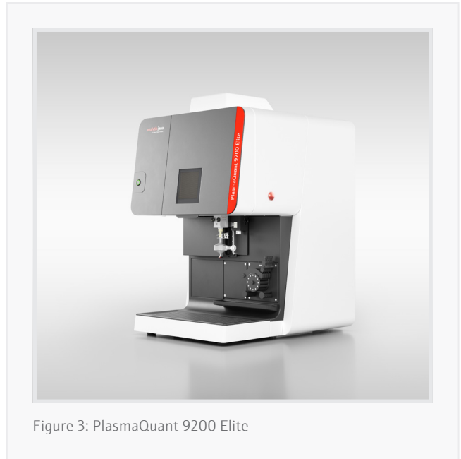
Figure 3: PlasmaQuant 9200 Elite

The exceptional precision and accuracy in lubricating oil analysis has been demonstrated by Analytik Jena's PlasmaQuant 9200 Elite ICP-OES in this study. The analyzer can easily fulfill the requirements of method ASTM D4951. The robust plasma and the high matrix tolerance make the PlasmaQuant 9200 Elite the ideal instrument for routine oil analysis. The unique V Shuttle Torch minimizes maintenance due to minimal carbon deposition. The high-resolution optics easily separate analytical lines from interferences, such as carbon-based emission. In summary, Analytik Jena's PlasmaQuant 9200 Elite ICP-OES provides an easy solution for evaluating lubricating oil accurately, effectively, and timely.