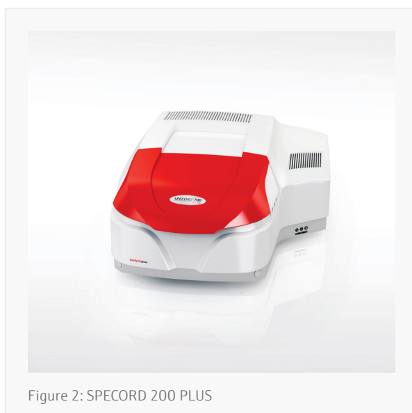
Figure 2: SPECORD 200 PLUS

The SPECORD 200 PLUS double-beam spectrophotometer enables the fast, precise and simple determination of the concentration of phosphorus in sewage sludge according to DIN EN ISO 6878. The automatic calculation of the concentration as a function of dilution and weight in the ASpect UV software supports the error-free determination of concentration values. A sophisticated range of accessories allows the use of cuvettes with different shapes and path length as well as automation for up to 116 samples.