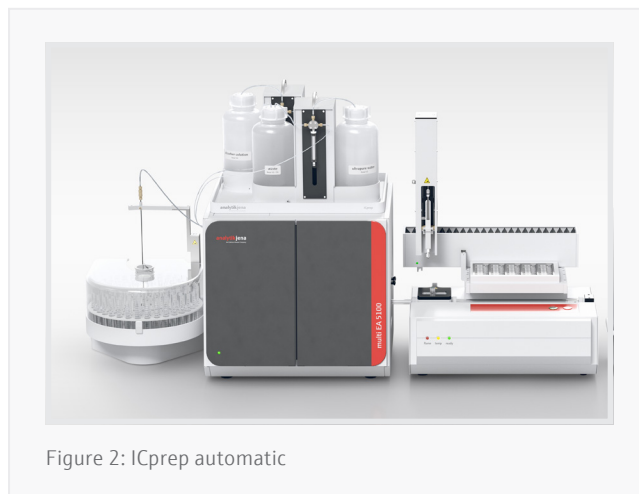
Figure 2: ICprep automatic

With the ICprep, digestion for fluorine and chlorine determination according to ASTM D8247 [1] is simple and cost-effective. In particular, a pyrohydrolytic digestion system can be an advantage when the sample number is low and the purchase of a cost-intensive coupled CIC (combustion ion chromatography) system does not yet justify it. An already in the laboratory existing ion chromatograph can then at any time be fed with the collected absorption solutions of the samples and thereby experience a higher utilization. In addition to the ICprep, the described digestion can also be performed with an AOX analyzer multi X 2500 or an elemental analyzer multi EA 5X00 if they are equipped with a corresponding kit for pyrohydrolysis and absorption. Thus, these analyzers can also be used for the determination of fluorine or chlorine and the utilization rate can be increased.