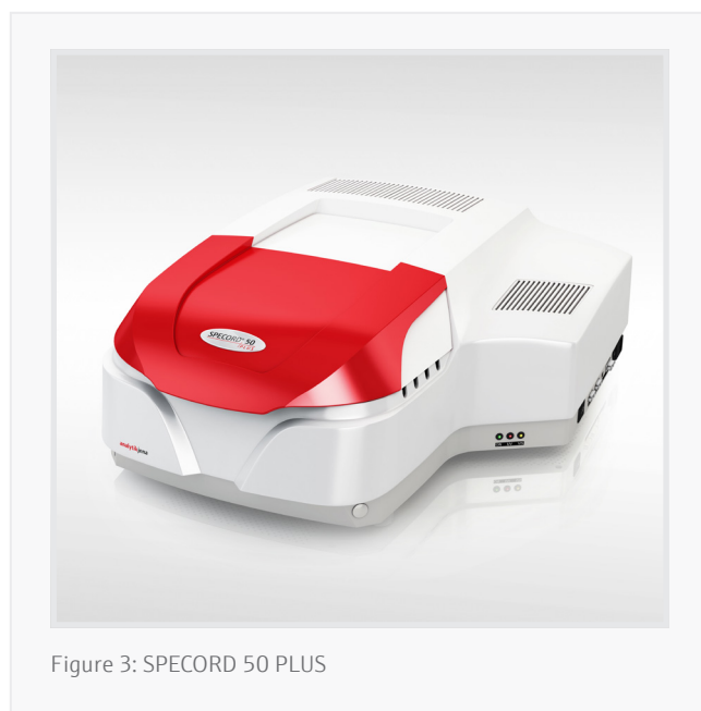
Figure 3: SPECORD 50 PLUS

The herein described spectrophotometric method leverages key insights into the development of phytoplankton in surface water. The water quality parameter chlorophyll a is a labile compound, which offers a narrow window for a reliable quantification. However, the method described in the DIN 38409-60 provides rapid and accurate determination with relatively simple sample preparation procedure. Furthermore, the easy spectrophotometric determination leverages access to a variety of components (e.g., other chlorophyll and carotenoids, phycobilin molecules). In this respect, the SPECORD 50 PLUS (see fig. 3) provides powerful spectroscopic performance, suitable accessories to fulfill the standard requirements in terms of cuvette pathlengths (50 mm), and a cuvette changer for higher throughput (6-fold cuvette changer, both for 10 and 50 mm pathlength). Finally, the ASpect UV software allows the predefinition of methods, blanks, and sample tables. Higher sample throughput (up to 116 samples) in the chlorophyll a determination can be also achieved using the APG autosampler with the sipper system.