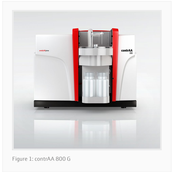
Figure 1: contraAA 800 G

In this study, a fast, easy, and sensitive complementary method for total fluorine analysis in wastewater is presented. This study shows that the MAS method can be successfully applied using the contraAA 800 G for the measurements. The optimized furnace program and calibration strategy provide high sample throughput, sensitivity, and accuracy. Only 3.5 minutes/replicate is needed for each sample. 100% recovery rate of QC sample is successfully achieved with an inorganic and organic mixture calibration strategy. The lowest LOD of 4 ppb is also achieved the inorganic and organic mixture calibration strategy. The results of fluorine determination by HR-CS-GF MAS show good reproducibility and long-term stability. Sample dilution and spiking can be easily achieved with an AS-GF autosampler. No additional cleaning steps are required for this method.