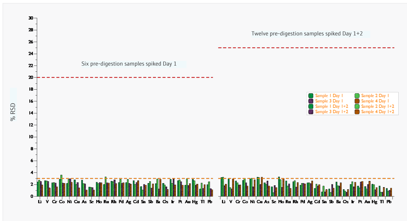
Figure 2: RSDs of six pre-digestion of all four samples analyzed in two different days. Criterion of 20% for day one and 25% for day-to-day stabilities accordingly to USP <232>